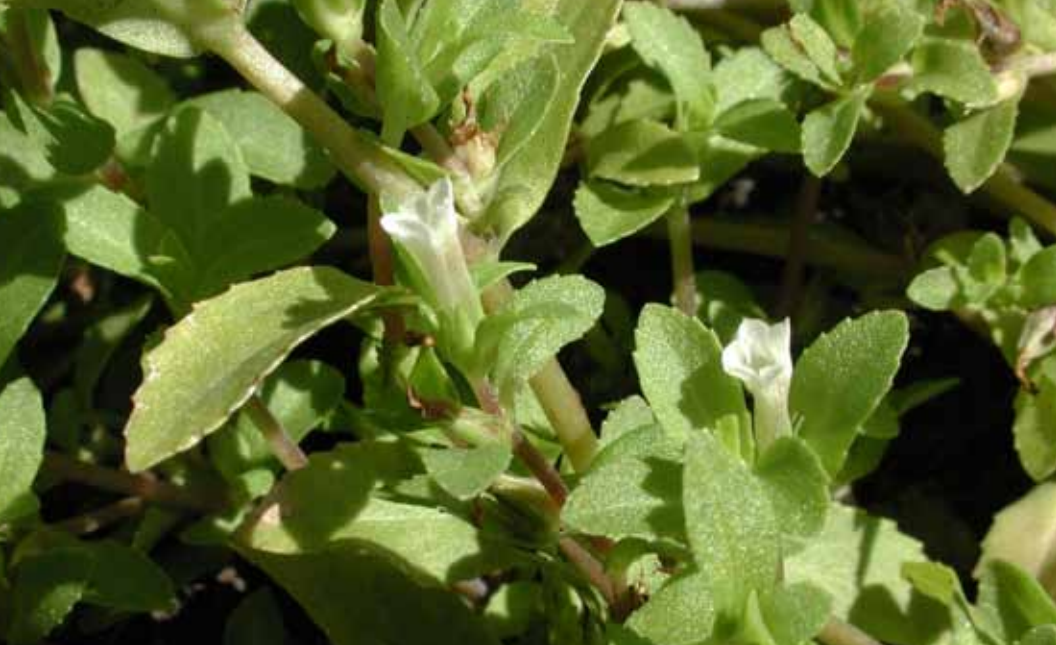
Limnophila fragrans var. fragrans