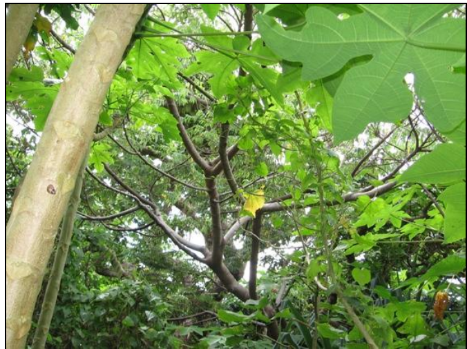
Figure 8. Trees and cover Bridled White-eyes were observed foraging in at the release site on Sarigan, CNMI, 12 May 2008.