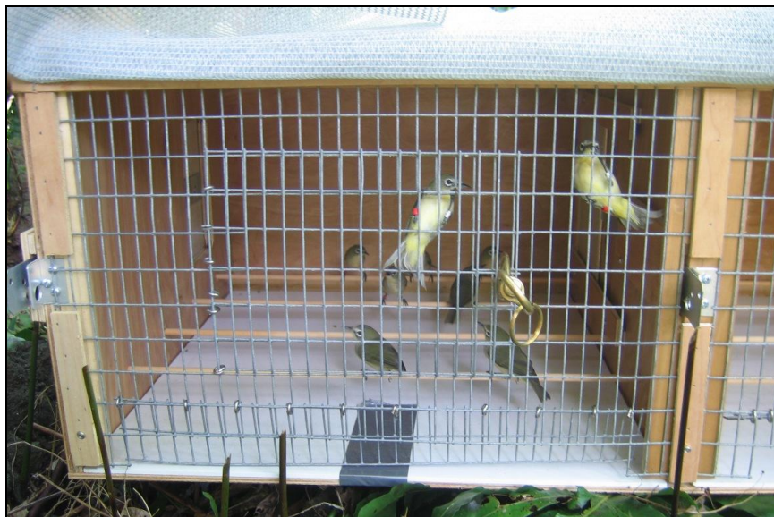
Figure 2. Front view of one compartment of the field release cage while in use on Sarigan, CNMI, 3 May 2008.

The front of the cage (and thus each compartment) was constructed of 1.3 cm by 2.5 cm welded wire hardware cloth with a 15.2 cm by 10.2 cm door in the middle of sections covering the front of each compartment (Fig 1A and Fig. 2). Below the door was another narrow door (measuring 10.2 cm in height) that ran the length of each compartment (Fig. 2). This second door allowed the removal of subfloors built into each compartment to facilitate cleaning. To serve as perches, four 0.6 cm by 91.4 cm dowel rods were inserted width-wise into the cage at approximately 6.4 cm above its floor, each spaced equally from the front of each compartment to the back. A shade cloth screen, which could be draped over the hardware cloth front wall, was secured to the top front edge of the release cage to provide privacy for the birds held within. This shade cloth covering could also be pulled up and placed over the top of the box to allow a clear view of its occupants.