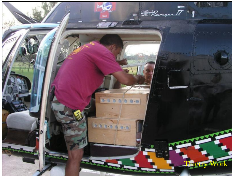
Figure 3. Americopters flight crew secure transport boxes in the helicopter on Saipan.

the birds. Next, the two transport boxes holding the radio-marked white-eyes were inspected for transmitters possibly dropped from birds between the previous morning and their arrival on Sarigan. As a result, four were retrieved from the bottom of the two boxes for a total of eight that needed to be reattached on-site prior to release.