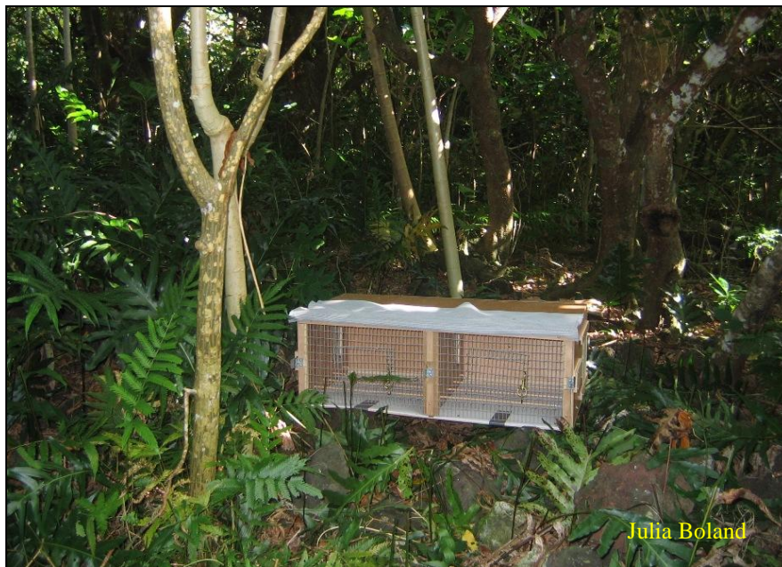
Figure 4. Field release cage at the release site prepared on Sarigan, CNMI, 3 May 2008.