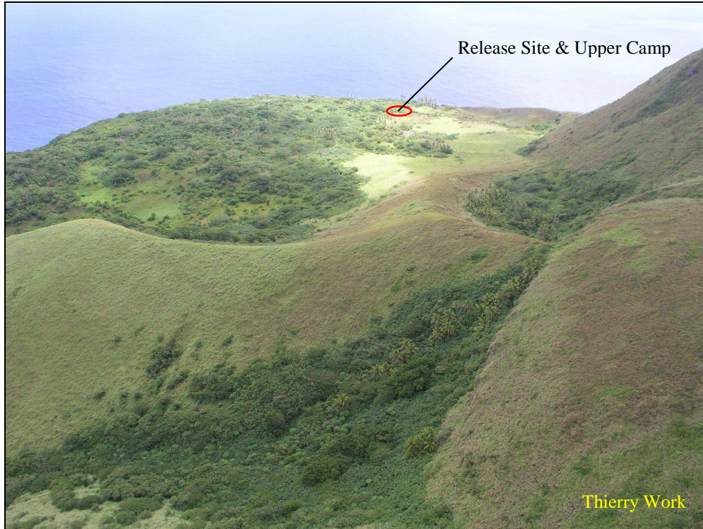
Figure 2b. The plateau on Sarigan from the southeast, primarily covered with native forest, and the location of the release site and upper camp as indicated.

numbered aluminum leg bands, and assessed for health issues. The first 20 of these birds were used to conduct a snail consumption study (MAC Working Group 2008) to ensure that they did not pose a realistic threat to endemic snails in Sarigan. Bridled White-eyes that were to be used for the snail consumption study were held and maintained in the Brown Treesnake (BTS) lab facilities on the DFW compound on Saipan. These facilities are air conditioned and quieter than the open aviary on the DFW compound, providing an environment of lower stress for the captives. The remaining individuals were held specifically for choosing 50 candidates to introduce to Sarigan. Of the 77 birds held, two died in captivity on Saipan from inanition.