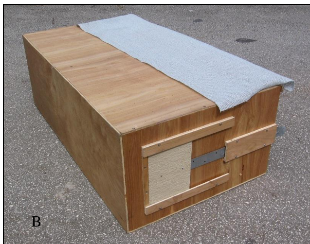
Figure 1. Front angle and back angle of the field release cage used to hold Bridled White-eyes for observation prior to release on Sarigan, CNMI, 3 May 2008