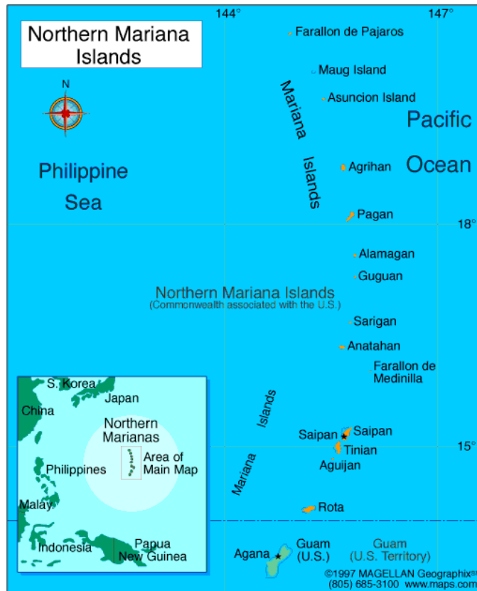
Figure 1. The Northern Mariana Islands.