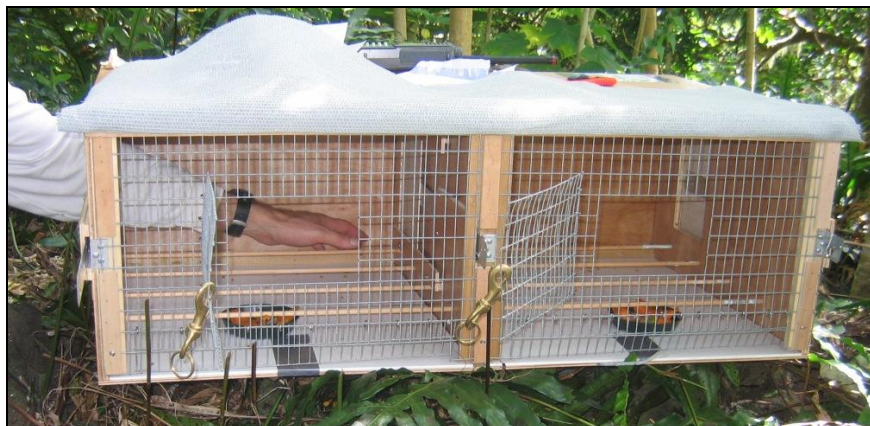
Field release cage with doors open after Bridled White-eyes have been released on Sarigan, CNMI, 3 May 2008.