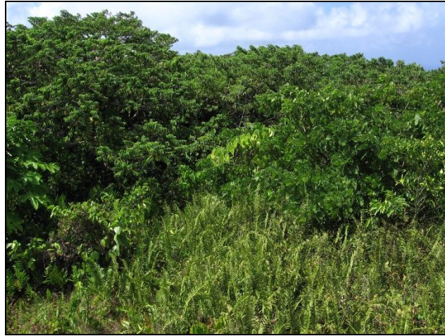
Figure 7. Low edge vegetation Bridled White-eyes were observed foraging in to the east and southeast of the release site on Sarigan, CNMI, 12 May 2008.