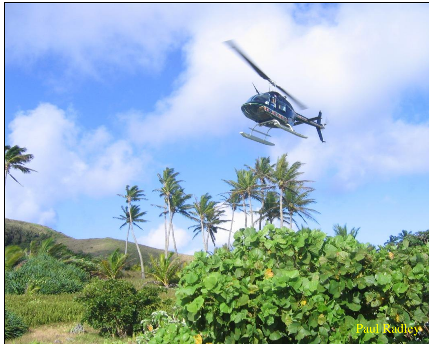
The Bridled White-eyes arrive at Sarigan, CNMI, 3 May 2008.