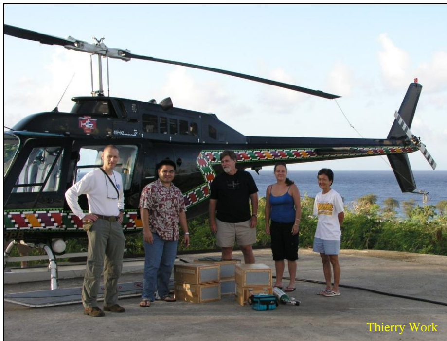
Members of the MAC Working Group with Bridled White-eyes (in field transport boxes) on Saipan, CNMI, prior to translocation to Sarigan.