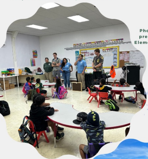
Photo of DFW staff presenting at Oleai Elementary School for career day!

We aim to educate individuals of all ages about various aspects of aquatic environments, water safety, and the importance of conservation. This program offers a wide range of educational opportunities, including classes, workshops, and hands-on experiences, to promote a better understanding and appreciation of aquatic ecosystems.