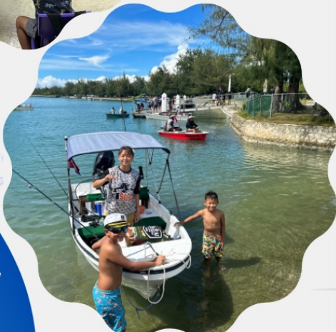
A few of the anglers that participated in the ISLA derby 2023 - Smiling Cove Marina, Saipan